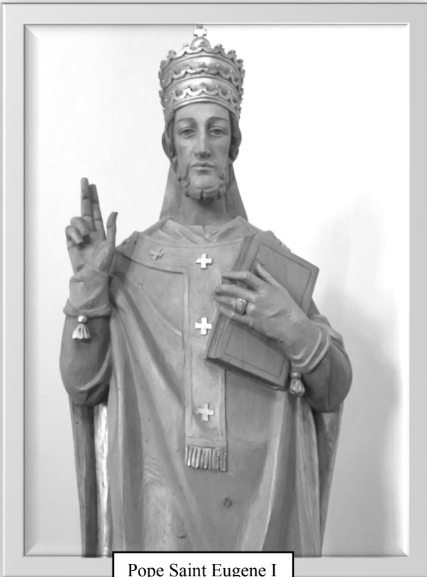
Pope Saint Eugene I

TUCKAHOE ROAD AND CENTRAL PARK AVENUE YONKERS, NEW YORK