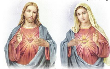
Sacred Heart of Jesus Immaculate Heart of Mary

On to the What. What made all this possible? “In the sixth month, the angel Gabriel was sent from God to a town of Galilee called Nazareth, to a virgin betrothed to a man named Joseph, of the house of David, and the virgin's name was Mary...Then the angel said to her, “Do not be afraid, Mary, for you have found favor with God. Behold, you will conceive in your womb and bear a son, and you shall name him Jesus...Mary said, “Behold, I am the handmaid of the Lord. May it be done to me according to your word.” (Luke 1:26-27, 30-31, 38) What made all this possible? The sinless soul and devoted heart of our Blessed Lady. A heart filled with such great charity that even though She knows of the divine life within Her womb, She does not glorify Herself... “Mary said: ‘My soul proclaims the greatness of the Lord; my spirit rejoices in God my savior. For He has looked upon His handmaid's lowliness; behold, from now on will all ages call me blessed. The Mighty One has done great things for me, and holy is His name.’ (Luke 1:46-49) Because of Her great love, because of Her immaculate heart, the Blessed Virgin Mary, was able to say “Yes” to the Angel Gabriel in words since She had already given Her heart to God.