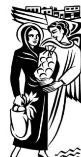
St. FRANCES of Rome and her Guardian ANGEL

r.i.p. (requiescat in pace: rest in peace), a.i.d. (ad intentionem donoris: for the intention of the donor) pro sal. (pro salutem: for health), pro populo (for the people)