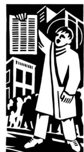
ST. JOHN OF GOD