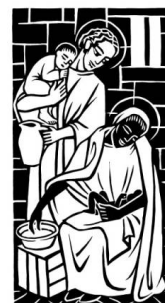
ss. Perpetua & Felicitas