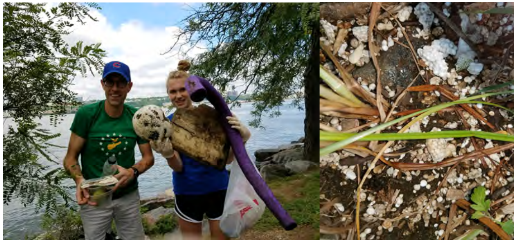
Photo caption: From SFX coastal cleanup: Plastic was clearly the biggest item of litter collected along the Hudson River. Of that, Styrofoam was prominent in many forms: big chunky pieces and thousands of tiny bead pieces. New York City has banned single-use Styrofoam products, effective January 1, 2019.

The City of New York has provided 100 reusable shopping bags to St. Francis Xavier Environment Ministry, and they will be distributed this weekend at the ministry table in the back of the church after each Mass. (limit one per person)