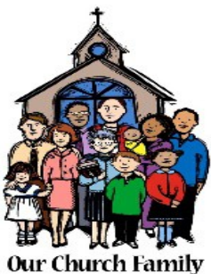
Our Church Family

Many ways. First of all, who is part of this community; who helps to make it what it is; who can the parish staff count on to help with the many significant programs and events in the parish. Then, of course, it helps to know how many families are 'part of us'? How many children can we expect to enroll in the first communion class this year so we can be prepared? How many children can we expect to enroll in Confirmation preparation? What can we expect from Young Adults? Are we addressing the needs of young married couples? Who are they? Should we have a vacation bible school? Who has what talents available for helping with many jobs needed for parish maintenance? How can we make a realistic parish budget? Will we have enough or will we have to cut some things out? With a small parish staff, many helping hands are needed.